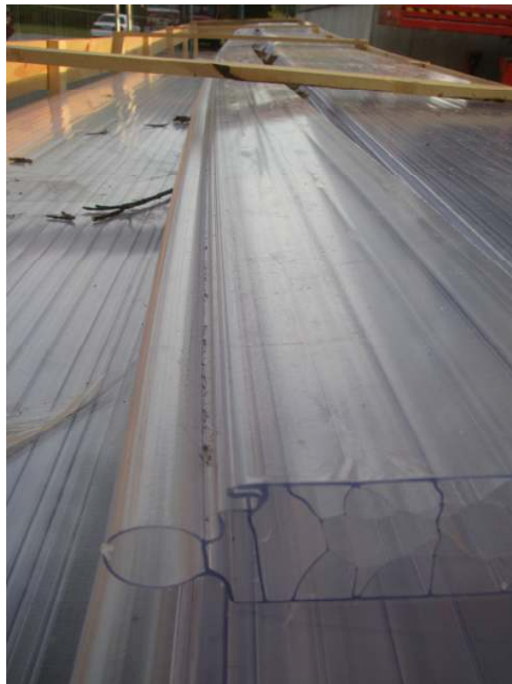
Left: The Extech® panels will be installed on the north wall of the National Marine Life Center's new marine animal hospital, facing Main Street, Buzzards Bay.