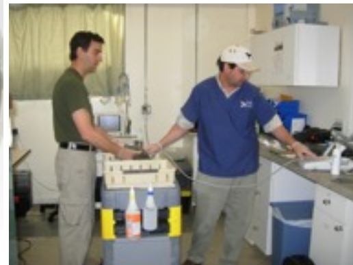
ultrasound on a Diamondback terrapin