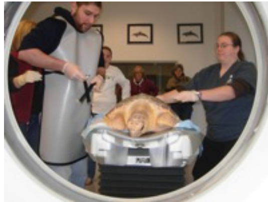
CT of a loggerhead sea turtle prior to release