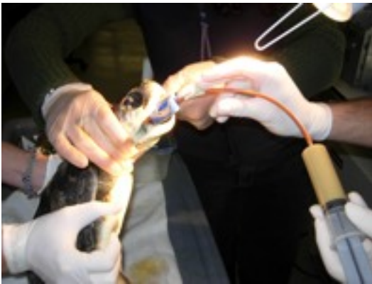
tube feeding a critically ill Kemps sea turtle